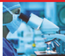
STEM CELLS IN FOCUS Catch up on all of Nature's stem-cell coverage at: www.nature.com/news/infocus/stemcell.shtml

cyst from which ES cells can be derived, but the deactivated gene means that the ball lacks the ability to implant in a uterus and so develop into a baby (A. Meissner and R. Jaenisch Nature doi:10.1038/nature04257; 2005).