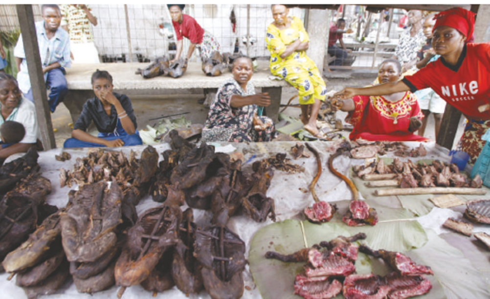
Although the bushmeat trade is a threat to chimp numbers, the Ebola virus is also taking its toll.

would take 150 years to recover, he says.