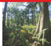
TREES FAIL TO SUCK UP EXCESS CARBON DIOXIDE Forests don't get a growth spurt from greenhouse gas. www.nature.com/news