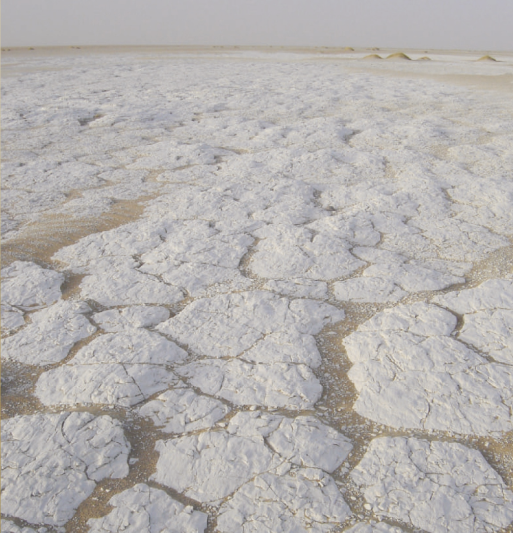
Choked: the Bodélé is covered in diatomite, which, when eroded, is the source of huge amounts of dust.