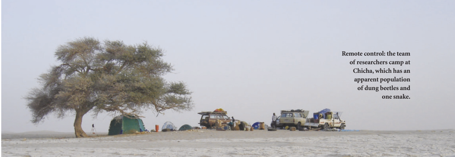
Remote control: the team of researchers camp at Chicha, which has an apparent population of dung beetles and one snake.

And when the temperature hits 40 °C by mid-afternoon, the team is forced to retreat to what the group has dubbed the ‘University of the Bodélé’: a tent containing camping chairs and a car stereo for entertainment.