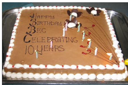
Physicists met in Banff (left) for the birthday of the first BECs, created by (left to right) Carl Wieman, Wolfgang Ketterle and Eric Cornell.