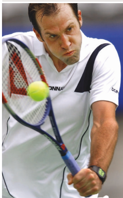
Tennis star Greg Rusedski was cleared of drug charges earlier this year after he said that he had taken contaminated supplements unwittingly.