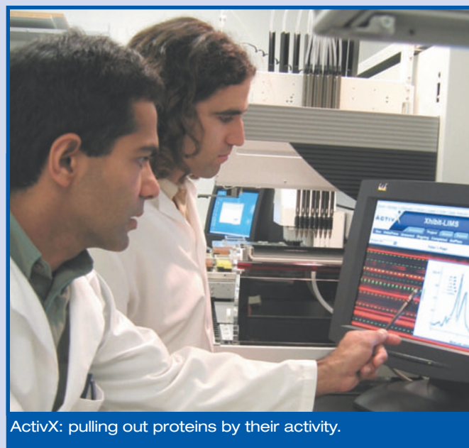
ActivX: pulling out proteins by their activity.