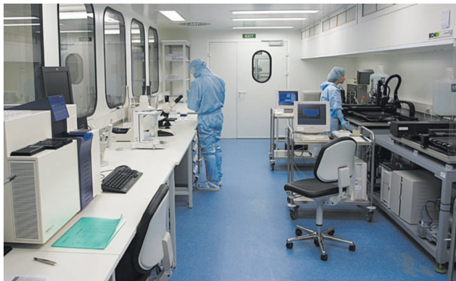
Zeptosens: microarrays must be made under rigorous clean-room conditions.

“We thought that after we had identified how many genes, how many proteins, the problem would go away,” says Celis. “But there are protein–protein interactions that give you different functions. Unless you