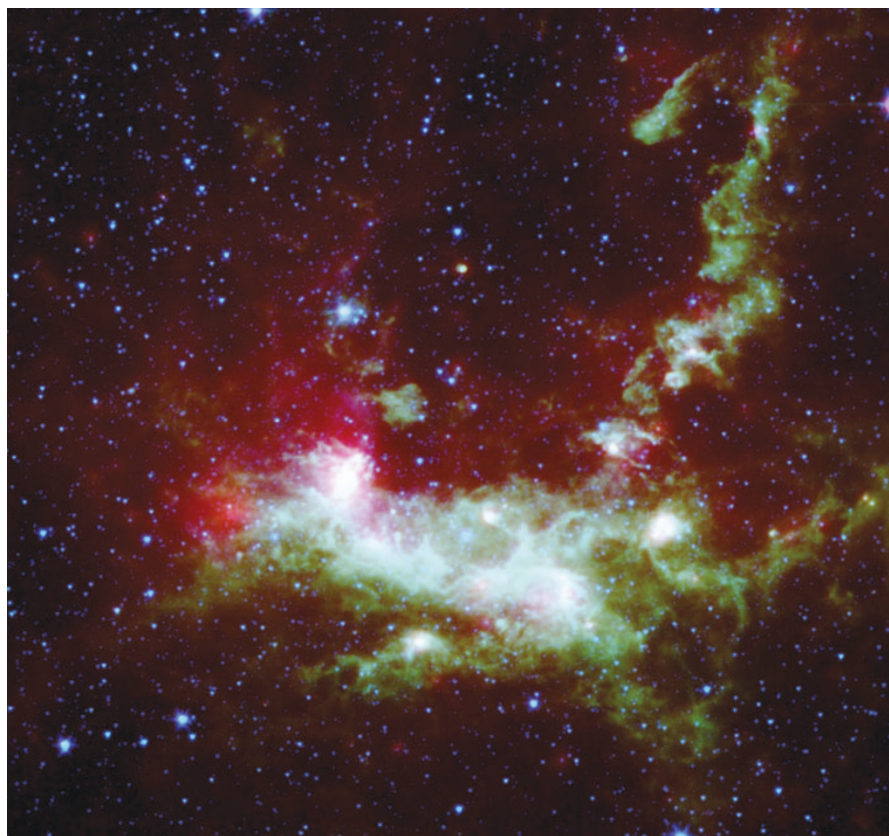
The ancestral home? We are made up of atoms that were created inside distant stars.