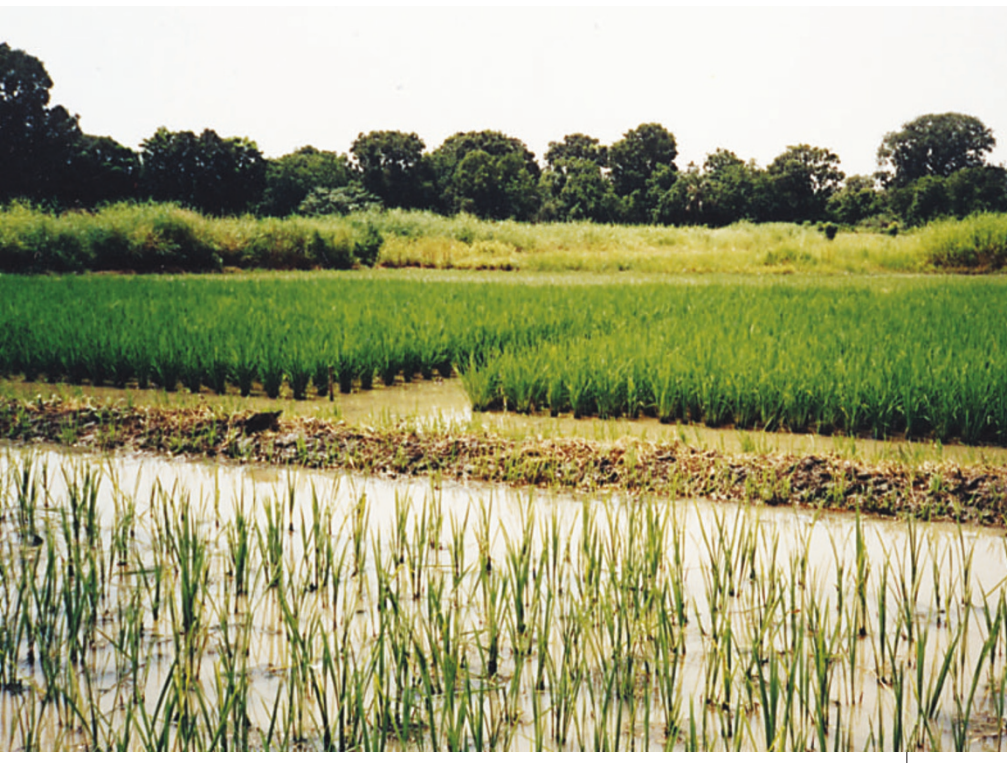
Wonder rice? The System of Rice Intensification involves more sparsely planted, drier fields than is normal. Its supporters believe it gives more than double the yields of conventional farming.

But although advocates of SRI routinely report yields up to twice those achieved by conventional agriculture, many eminent agronomists dismiss such achievements as the result of poor record keeping and unscientific thinking. A new set of field trials published this month<sup>2</sup> seems to support this view