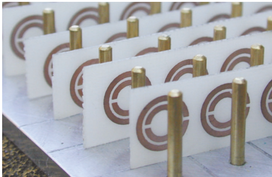
Fresh angle: metamaterials such as this copper-based structure have strange optical properties.

Although some physicists were sceptical about the results (see Nature 420, 119–120; 2002), subsequent experiments have led most to accept the finding, says John Pendry, a physicist at Imperial College in London who works on negatively refracting materi-