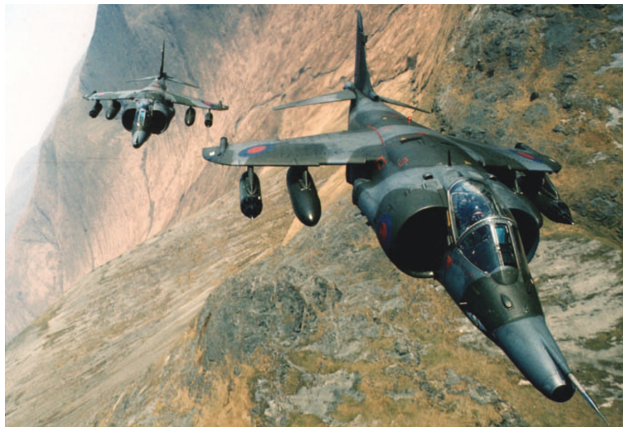
Outmanoeuvred: radar stations struggle to tell the difference between low-flying jets and wind turbines.

The MoD says that the 30- to 40-metre-long blades used on typical wind turbines can mask radar signals from low-flying aircraft or produce false alarms by reflecting radar