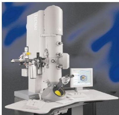
Tecnai G2 Polara from FEI.