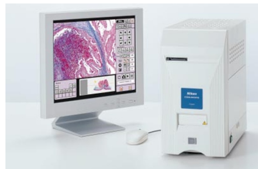
Easy viewing: Nikon’s Coolscope.

Using fluorescence to image living cells has become a major application for microscope producers and users. As well as its stand-alone microscopes, Leica Microsystems also produces the AS MDW, a dedicated workstation for the rapid imaging of molecular interactions in live cells. “All the hardware components, such as camera and piezo-focus, are designed in a way to optimize the speed of acquiring images,” says Werner Kampe, marketing manager for Leica’s compound-microscopy business unit. “That’s important not just for scientists; it’s also important not to damage the living cells under the microscope. The