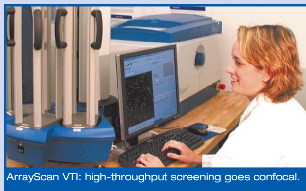
ArrayScan VTI: high-throughput screening goes confocal.