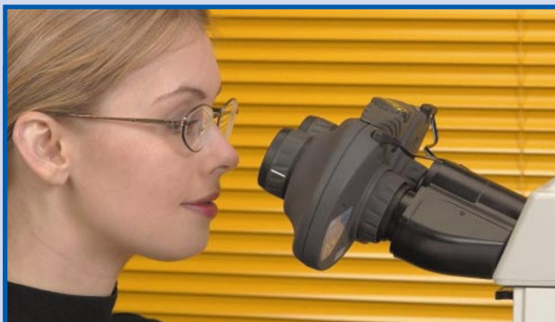
Isis eyepiece from Vision Engineering gives a wider view.

Many manufacturers now design their microscopes to be ergonomically efficient, making operation as simple and intuitive as possible while