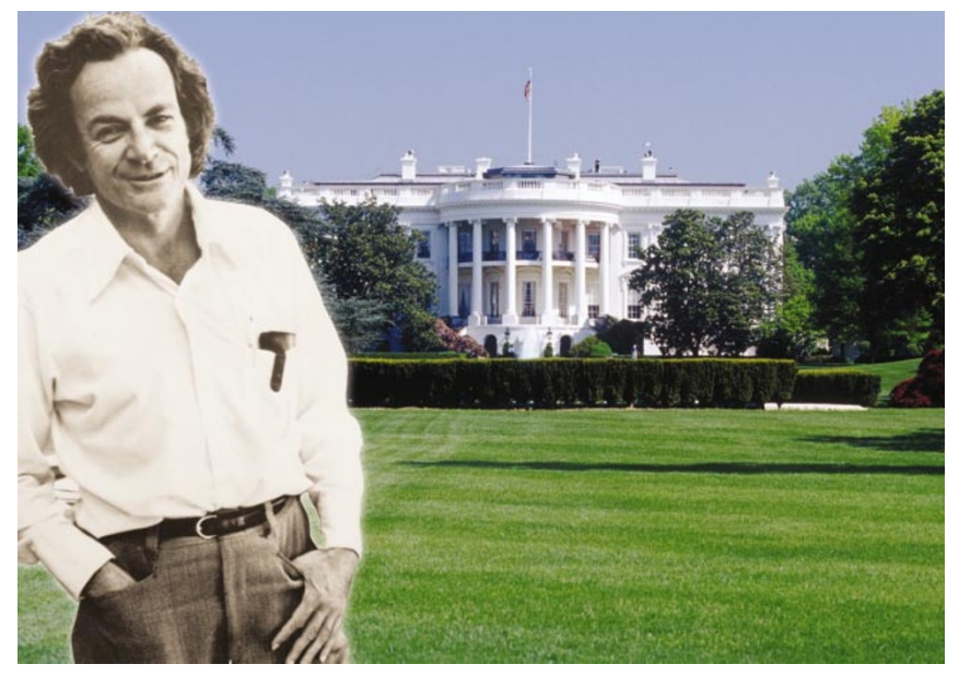
Power surge: science would have benefited if Richard Feynman had made it to the White House.

When a hypothesis or assertions are precise and can be tested, a free society that demands full disclosure will eventually sort it all out. A recent example of just that was the