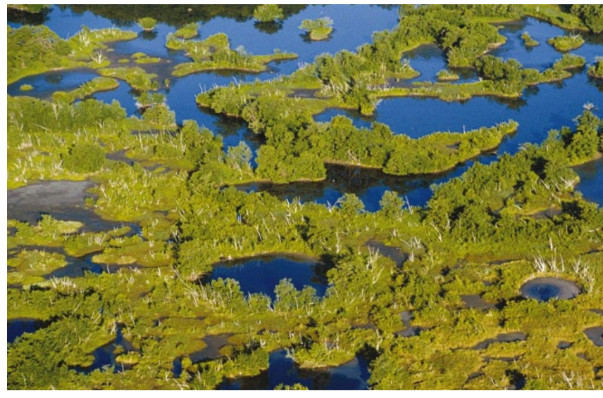
Bittersweet business: a flow of phosphorus from sugar farms poses a threat to Florida's wetlands.

Ecologists want phosphorus levels to be kept below 10 parts per billion (p.p.b.), but levels are as high as 80 p.p.b. in some water flowing into the Everglades. As a result, a 'phosphorous front' has been gradually encroaching on the wetlands at around a kilometre per decade, says ecologist Evelyn Gaiser of Florida International University in