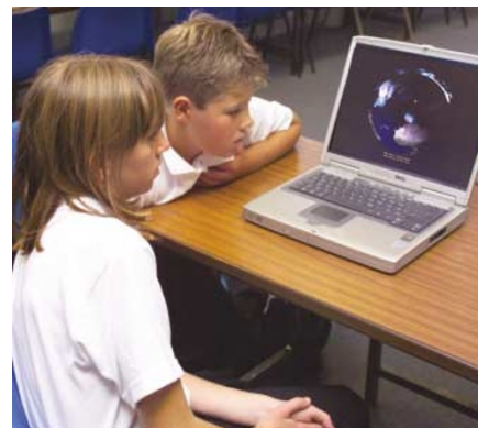
Future in their hands: children at Gosford Hill school in Oxfordshire examine a simulation.

Slightly simplified versions of a model that has been developed at the Hadley Centre for Climate Prediction and Research in Bracknell, UK, will be available for downloading from the project website. Each model uses a unique set of rules and simulates a 15-year period, during which the stability of the rules is checked. It then simulates 15 years of current climate conditions, and finally a world with increased greenhouse-gas concentrations. This should produce better estimates for a