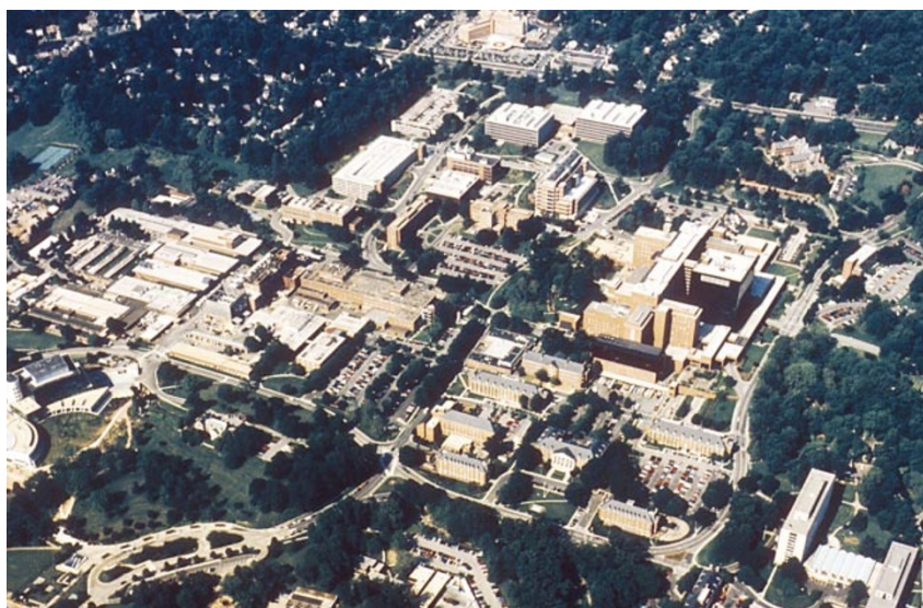
Overall control: the US National Institutes of Health may be given greater autonomy.

But the authors, who released their proposals on 29 July, stopped short of endorsing the sweeping changes that some observers