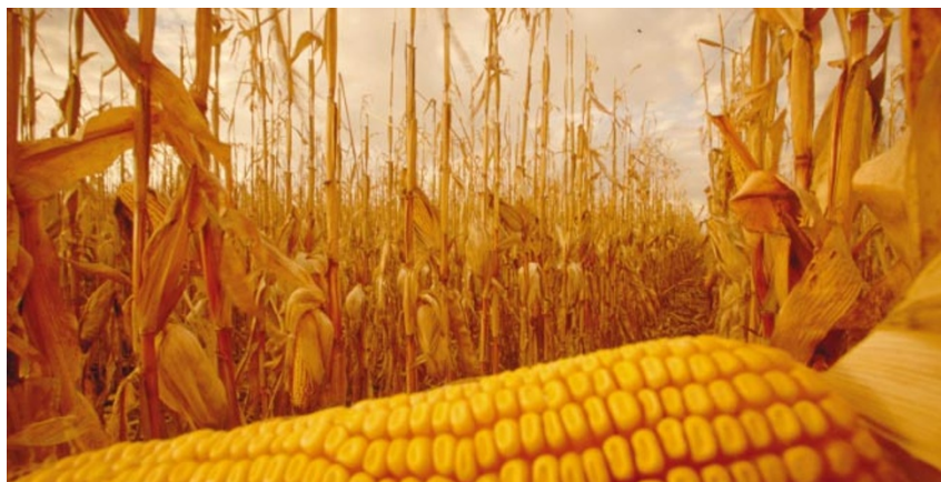
Corny question: as the maize genome map nears completion, should a full genome sequence be next?

On 10 July, the investigation was expanded after an NIH programme administrator told reporters that even though he was removed from his role in 1995, he has since been paid an annual salary of $100,000 while doing almost no work for the agency. This, together with the fact that Congress requested the report, makes it less likely that the study will be ignored, observers say. ■