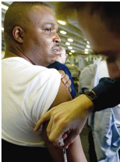
At the sharp end: anthrax vaccines for US troops are a high priority for the Bush administration.

Congress and the administration have been wrangling over the anthrax-vaccine