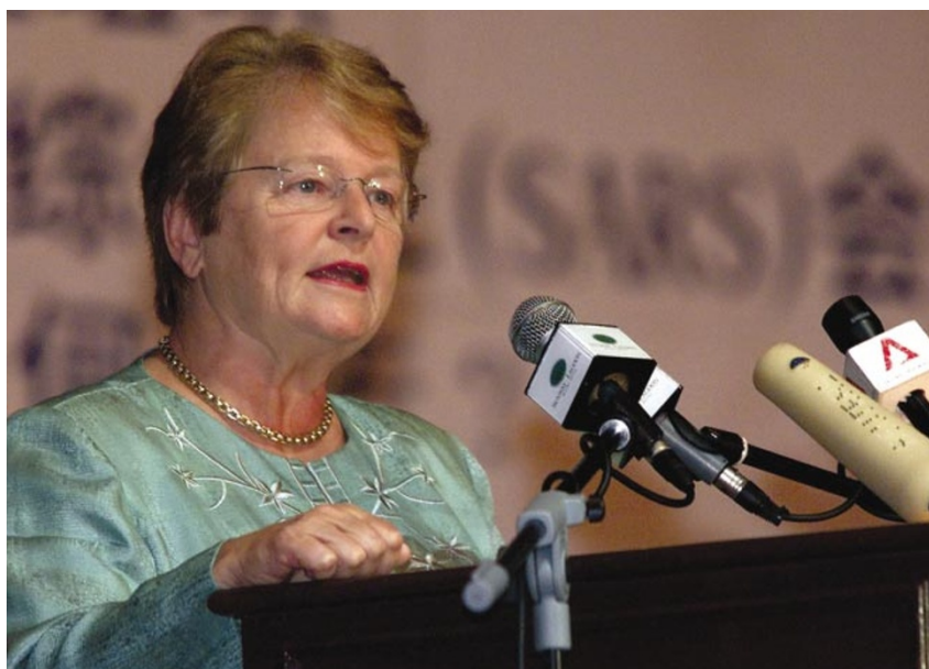
Action stations: Gro Harlem Brundtland warns against complacency over infectious diseases.