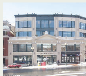
Great foundations: the Clay Mathematics Institute.

The rules require that the proof appear in a peer-reviewed outlet and then survive two years of scrutiny. Grigory Perelman's papers containing a possible proof of the Poincaré conjecture