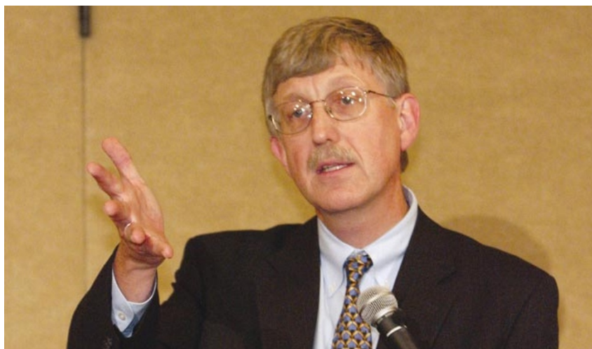
Francis Collins supports the publication of genome analyses before the sequence is completed.

The Wellcome Trust, the London-based medical charity that convened the meeting, will also apply similar rules to the large-scale genome-sequencing projects for which it provides funding. Both organizations may also extend the rules to other large-scale