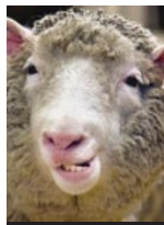
Get stuffed: Dolly will stay in the public eye.