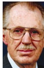
Roscoe Bartlett: unhappy with science funding.

But the confirmation of the figures for 2003 has put the budget proposed by President George Bush for 2004 (see Nature 421,