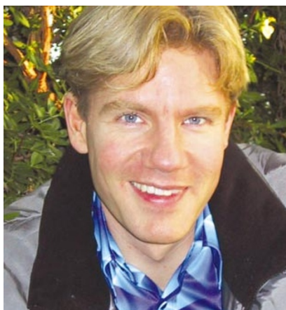
Bjørn Lomborg contends that an ethics committee was the wrong forum to judge his book.