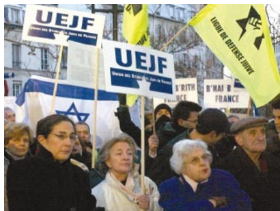
Out in the cold: protesters condemn a proposal to exclude Israel from research collaborations.

Among those backing the Internet petition are nine Nobel prizewinners — among them David Baltimore, Claude Cohen-Tannoudji,