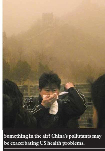
Something in the air? China's pollutants may be exacerbating US health problems.