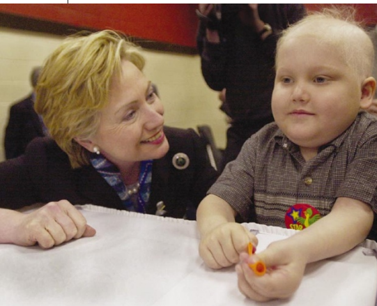
Hillary Clinton, seen here with a leukaemia patient, is pushing for better disease monitoring.

Two dozen staff are due to start work this month at Trinidad Head, and plan to collaborate with scientists from China, Japan and Korea. They will continuously monitor the dust using radiation detectors, gas chromatographs and mass spectrometers, with further data provided by NOAA aircraft on coastal flights. ■