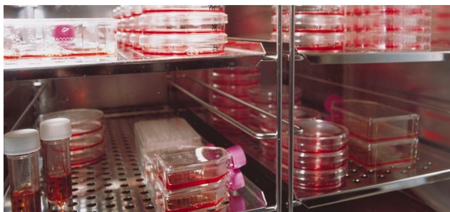
Wise investment? A new cell bank will make stem cells far more readily available to researchers.

Coming on top of recent British regulations, which are among the first in the world to endorse publicly funded research on embryonic stem cells, science administrators hope that the cell bank will help to foster world leadership in the emerging field of regenerative biology.