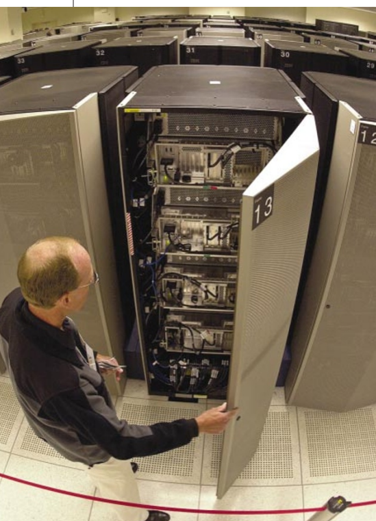
Livermore's ASCI White computer can be used to simulate nuclear weapons — old and new.