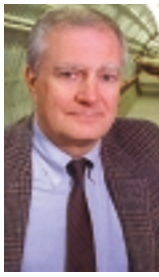
John Marburger thinks a US role in ITER "should be reconsidered".