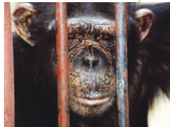
Down and out: researchers are worried that the Coulston chimps could end up homeless.

Space for chimps in the United States is limited, and the issue of their long-term care