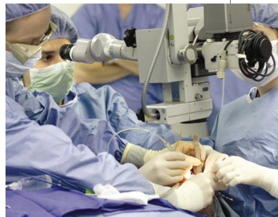
Clear cut: the high-intensity beams from free-electron lasers have been used in eye operations.

frequency to make DNA vibrate by interacting with the concentrations of charge found along DNA's double helix. Researchers can then follow interactions between the vibrating DNA and other molecules by studying the way additional FEL pulses are scattered.