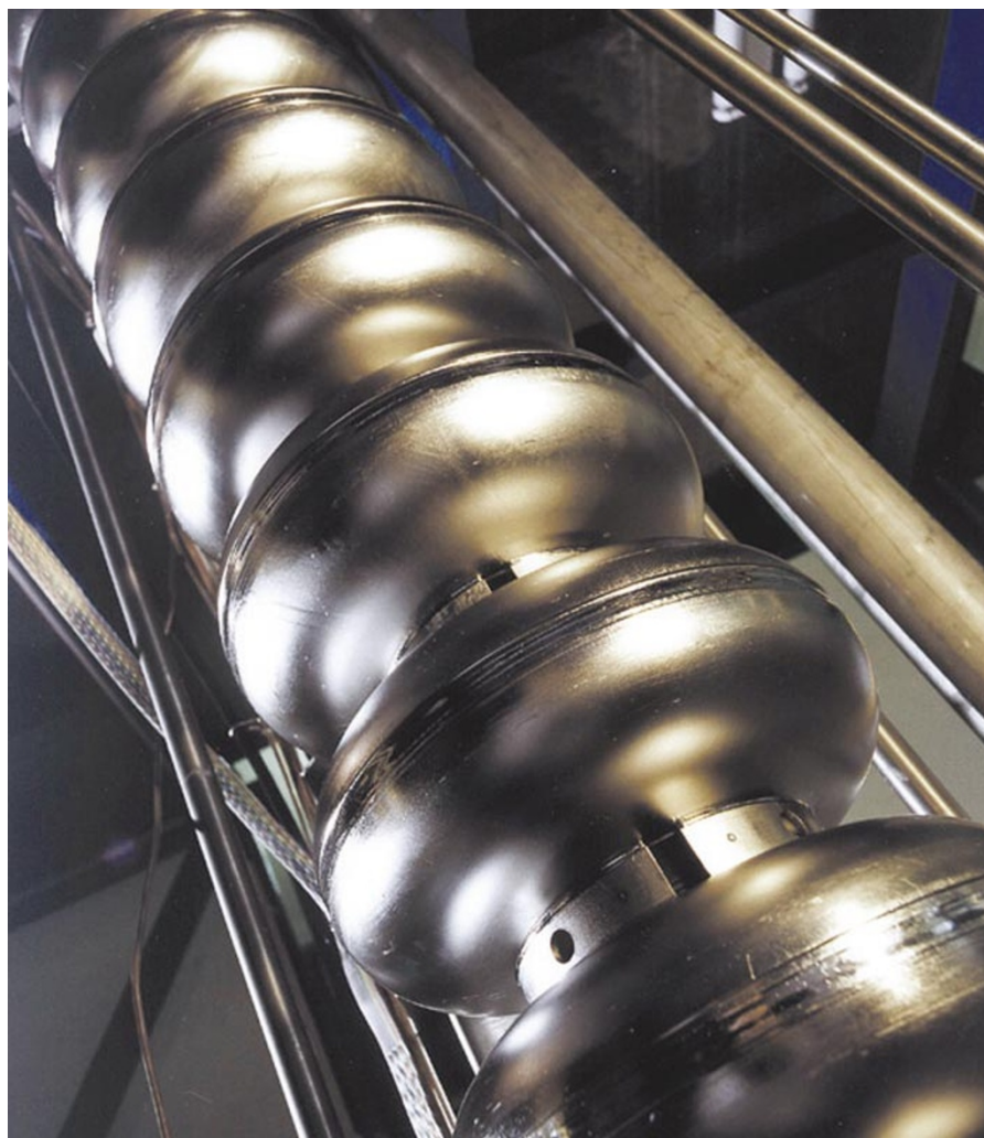
This German particle accelerator forms the basis for a new generation of high-intensity lasers.

FELs, like synchrotron X-ray sources, exploit the radiation emitted by fast-moving electrons as they change direction. Large FELs, such as those planned at DESY and SLAC, use particle accelerators to boost bunches of electrons to close to the speed of light. The bunches pass through an