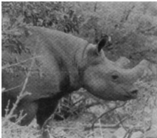
FIG. 1 Regrowth of horns in an adult black rhino female 3 years after dehorning.

poachers. If larger-horned rhinos were preferred trophies, then recently dehorned individuals would remain of low value. However, the similarity between mass categories of horns confiscated from poachers and those on live rhinos in extant, wild populations (Fig. 2)