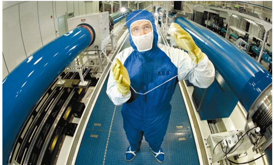
Laser gazer: part of the Beamlet, which is used to capture images of material compressed by X-rays.