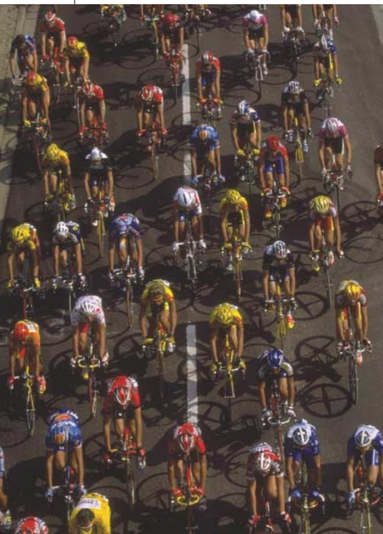
Figure 1 Go with the flow: in cycling races, competitors often bunch into packs, giving them an aerodynamic advantage which may belie an individual's true ability.

The appropriate percentage value for the boost and length of the range will be different for different sports, but the same for different competition formats in the same sport. In cycling (Fig. 1), the boost is due to aerodynamic and psychological effects 1 , whereas in orienteering it occurs when a competitor is able to follow another within sight without the need to map-read. In each case, the leading competitor is unaffected. The number of competitors, distribution of u_i values, and initial separations depend on the particular competition