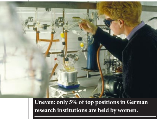
Uneven: only 5% of top positions in German research institutions are held by women.