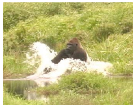
Figure 1 A solitary silverback performing a 'body splash' display at Mbeli Bai, Nouabalé-Ndoki National Park, Congo (Brazzaville).