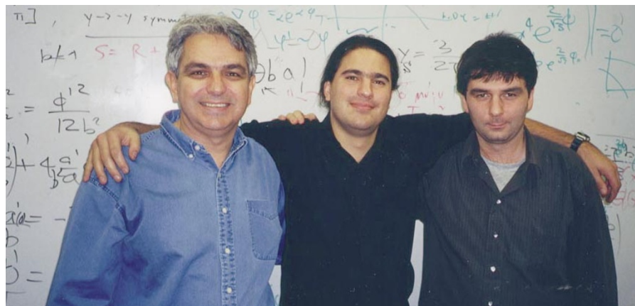
The brains behind the branes: left to right, Savas Dimopoulos, Nima Arkani-Hamed and Gia Dvali.

In 1998, while working at Stanford University in California, Arkani-Hamed, Savas