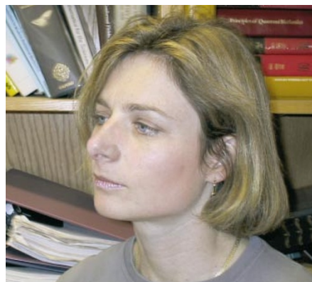
Hidden force: Lisa Randall suggests that gravity may leak into a parallel brane universe.

One entertaining version of brane-world theory offers an unusual explanation for 'dark matter', the Universe's 'missing' mass that can be detected by its gravitational influence, yet