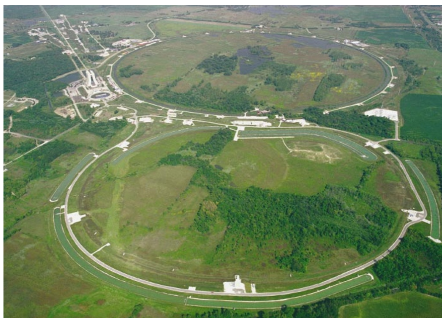
Crash course: the newly refurbished Tevatron will put some variants of brane theory to the test.

As more dimensions are added, the length scale over which these effects would show up becomes smaller. But even with seven additional dimensions — the same number as in the leading variant of string theory — it would only shrink to about the size of an atomic nucleus. That is a far cry from the 10^{-35} m of