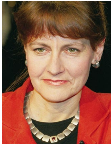
In with the new: science minister Edelgard Bulmahn aims to encourage younger academics.

"There is no transparency at all, only personal dependence," he says. "Everything is fine if your institute head is well-disposed