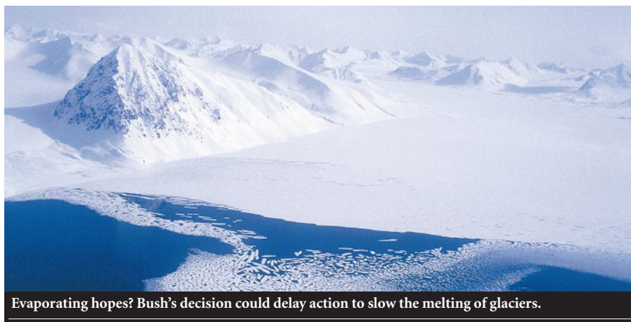
Evaporating hopes? Bush's decision could delay action to slow the melting of glaciers.

International leaders took the unusual step of commenting on Bush's decision. Margo Wallström, environmental commissioner for the European Union, said in a statement that she was concerned about Bush's characterization of the science of global climate change. And Klaus Toepfer, executive director of the United Nations Environment Programme, said in a speech in Denmark that he doubted there could be an effective global response to climate change without US leadership. ■