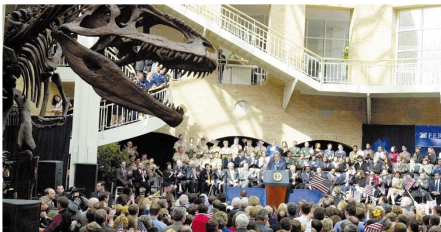
Bare bones of the budget: Bush enlists support for his spending plans at Fernbank Museum in Atlanta.

The NSF can only be envious. In September, Rita Colwell, the NSF's director, requested a 15% increase to the agency's $4.4 billion