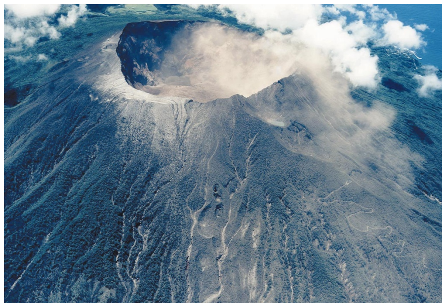
Blowing its top: Mount Oyama spews out thousands of tonnes of toxic gas every day.

♦ http://www.aist.go.jp/GS/J/~kaz/miyakegas/COSPEC.html