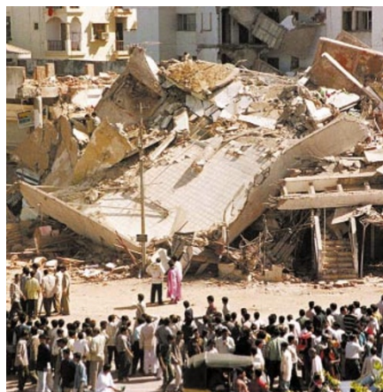
Seismic shock: the Indian government plans to build 40 seismic monitoring stations.

The mild-mannered Brazilian president, Fernando Henrique Cardoso, warned of a possible trade war with Canada, and the ban sparked public protests and led to Canadian whisky being dumped in the streets of São Paulo. ■