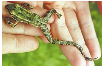
It's no croak: a combination of environmental factors is behind frog deformities and deaths.