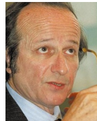
Research minister Schwartzenberg will not rule out cloning.

Opponents will argue that creating embryos for research runs counter to the European convention on bioethics, which France has signed, and that the proposed therapeutic cloning provisions would prevent France from ever ratifying the convention.