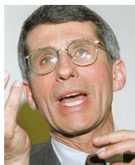
NIH's Anthony Fauci backs international AIDS research.

Nine-tenths of those polled said research should be a priority for France, and two-thirds that the research budget should be increased; only 3% thought it should be reduced. A career in science was regarded as attractive by 84%. ■