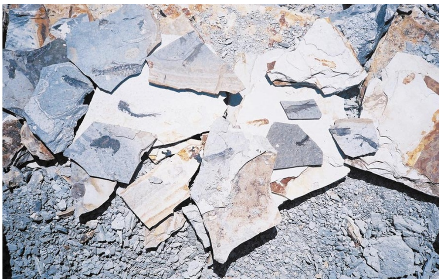
Reeling them in: fossils of small fish unearthed at Songzhangzi.

A fossil dealer had set up a makeshift stall in the lobby of the palaeontologists' hotel.