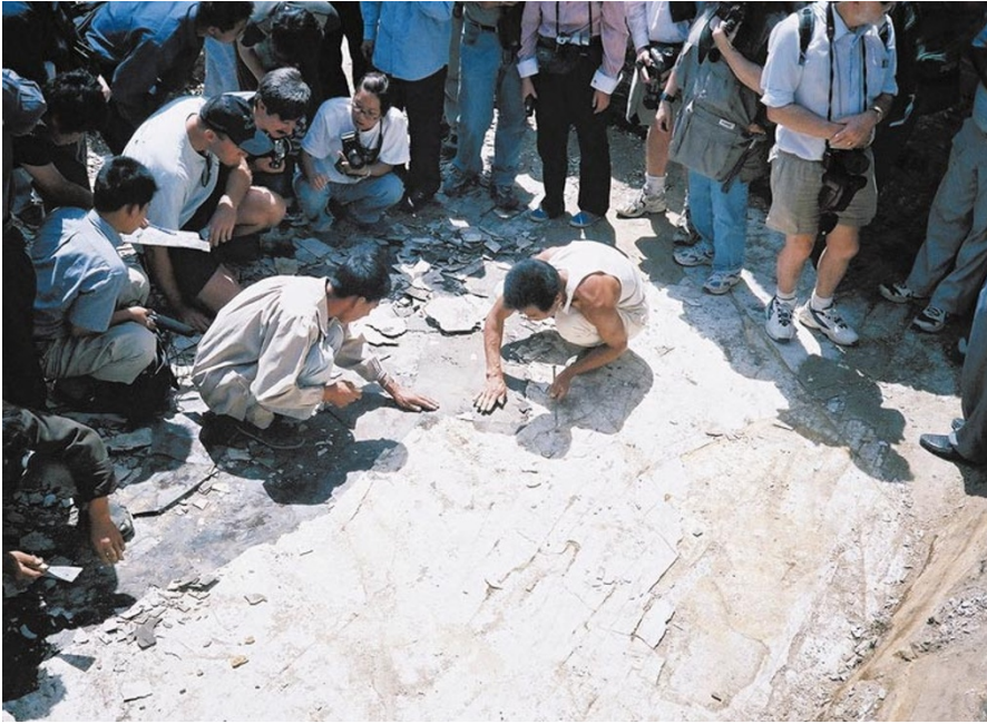
Catching the early bird: locals at Sihetun work to reveal what appears to be a Confuciusornis (right) to visiting western palaeontologists. But such fossils often end up on the black market.

Such specimens sell for thousands of dollars on the international market, and the villagers of Liaoning province know it. Before the SAPE group arrived, the Sihetun quarry had been filled in with loose rocks to prevent pilfering. It took weeks for villagers with wheelbarrows to remove this protective fill before the IVPP could conduct its demonstration.