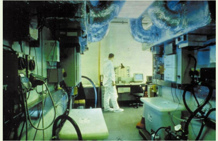
Figure 1 The Ecotron experiment creates model multitrophic community assemblages containing plants, herbivores, parasitoids and decomposers in 16 different chambers. The Ecotron is an ambitious attempt to bridge the scale between field communities and laboratory experiments. (Photographs show the inside of an Ecotron chamber and a technical service corridor between two banks of chambers; courtesy of the Centre for Population Biology, Imperial College at Silwood Park.)

fairly regular waxing and waning of a population's density). Such background population variability, whether driven by biotic or abiotic processes, can provide species with the opportunity to respond differentially to their environment. In turn, these differential species responses weaken the destructive potential of competitive exclusion.