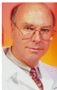
Venter: modifying sequencing plans.

Now Celera will need to hang its sequence data on the framework produced by the public project. Celera used the same approach to sequence the Drosophila genome, in collaboration with the Berkeley Genome Sequencing Project (see Nature 401, 729; 1999).