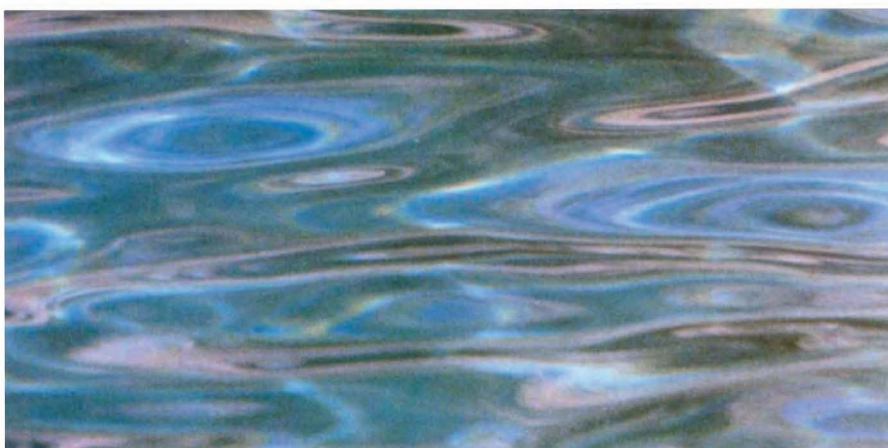
Fig. 2 (top) Skypools and landpools in a reflection of an extended source.