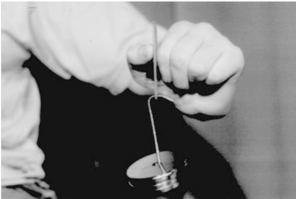
Figure 1 Lateral grasp measurement with plastic plate and weights

Due to an author error, Figures 1 and 2 of the above paper were incorrectly reproduced. The correct versions of both figures are reproduced below: