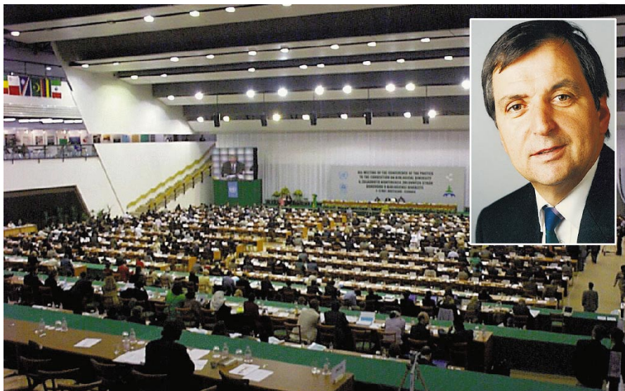
Hearing the news: last week's biodiversity meeting heard Töpfer (inset) spell out his proposals.

In a nine-page paper outlining his proposals, Töpfer says UNEP has a mandate from the UN general assembly to take a closer involvement in the conventions that UNEP helped to set up. These include the biodiversity convention, the Convention on