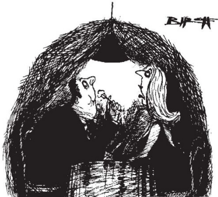
"Looks like the wind's dropped again"

The Dutch are again turning to wind as a source of energy. At the end of the last century, more than 9,000 windmills were pumping water or grinding flour in the Netherlands, and if the present emphasis on wind energy continues, by the year 2000 there will be more than 2,000 megawatts of electricity produced from wind power. This is equivalent to about 13 per cent of the country's present requirement for electricity, which is not expected to increase much in the next few decades.