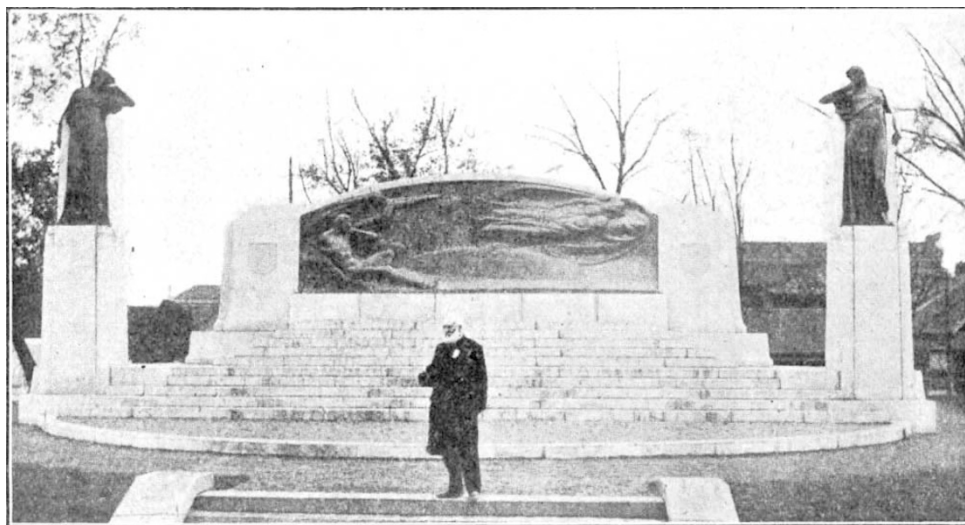
Memorial erected at Brantford, Ontario, to commemorate the invention of the telephone.